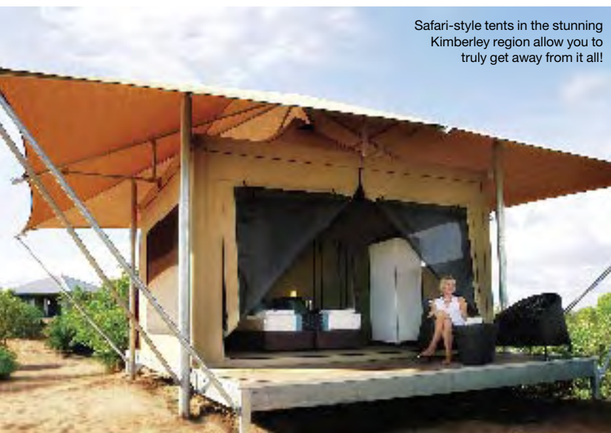
Safari-style tents in the stunning Kimberley region allow you to truly get away from it all!

Our roundup of the best Down Under news, views and gossip